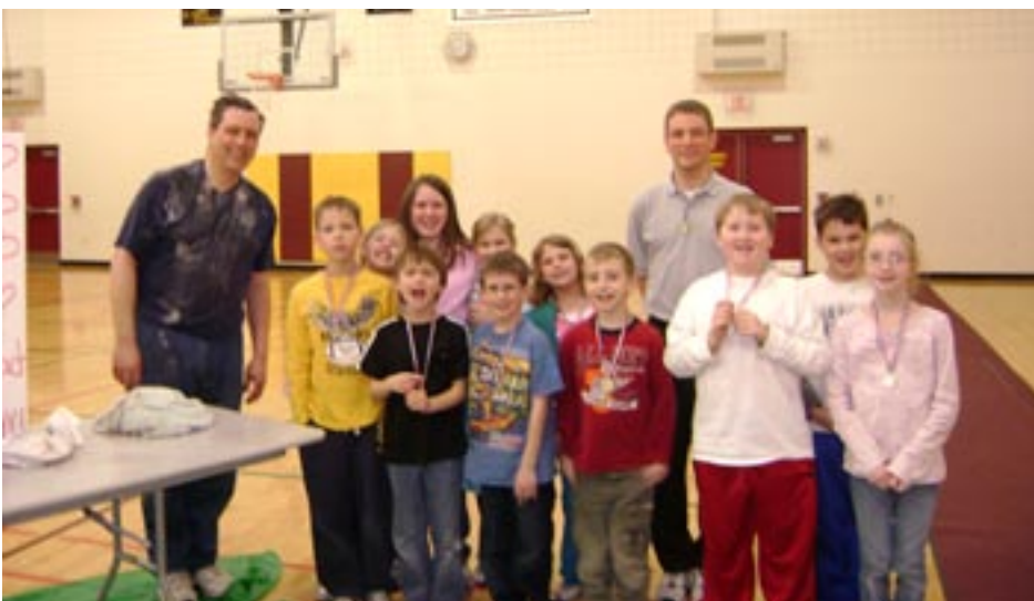
St. John Lutheran School in Watertown held a contest in conjunction with the collection that allowed winning students to toss pies at the principal. The students raised an amazing amount for the Alpha Center!