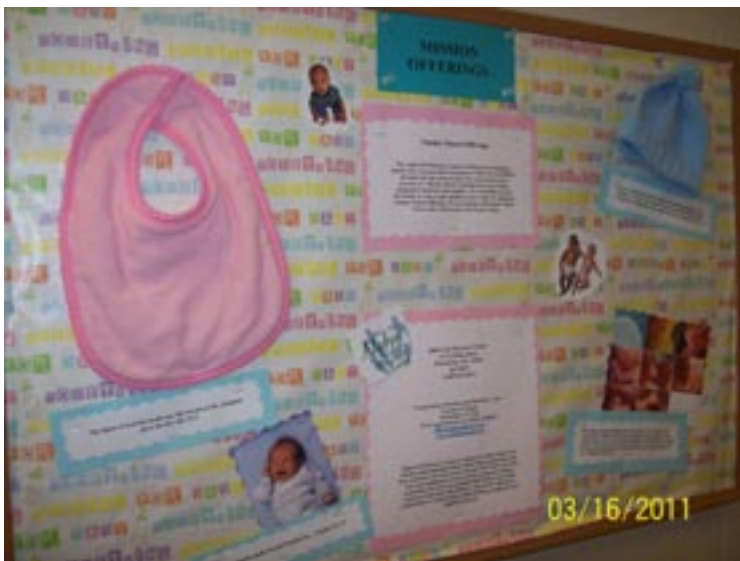
St. Luke Watertown and its Sunday School recently designated Alpha a quarterly mission offering recipient.

Whether your ability to help runs closer to pie-throwing contests or to quiet and steadfast attention, Alpha would appreciate your consideration. If you'd like some info about conducting a drive, call 261-9207 or e-mail office@alphalifecenter.com .